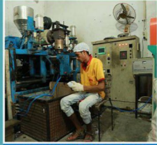
2 Machine Double Station Blowing Capacity- 50ml to 200ml