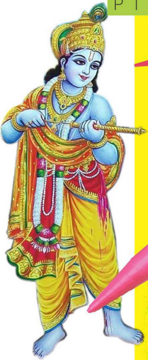
Kamakhya (Steel Road) - 6