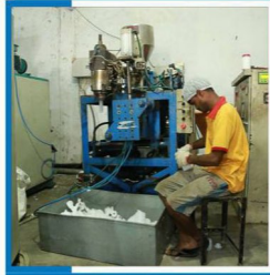
2-Machine Fully Automatic Blowing Capacity - 500ml, 1Ltr, 2Ltr