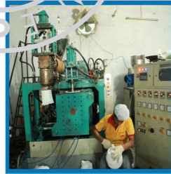
2-Machine Fully Automatic Blowing Capacity - 2Ltr, 3Ltr, 5Ltr, 6Ltr,