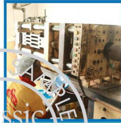
4-Machine Fully Automatic Injection Capacity - 100ml to 2Ltr.