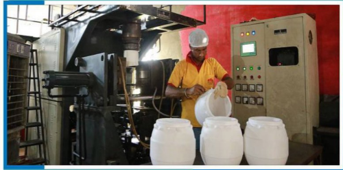
2-Machine Fully Automatic Blowing Capacity - 10Ltr 15Ltr, 20Ltr, 30Ltr