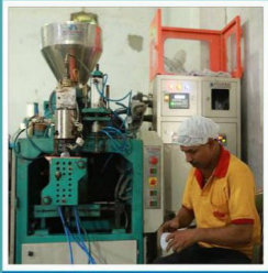
2 - Machine Blowing Capacity - 200ml, 500ml, 1Ltr.